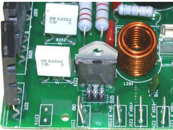
Figure 2. New Triac installed at Q213.